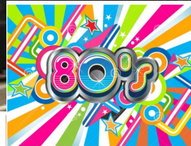
EASTERN YACHT CLUB PRESENTS 80'S PARTY!!