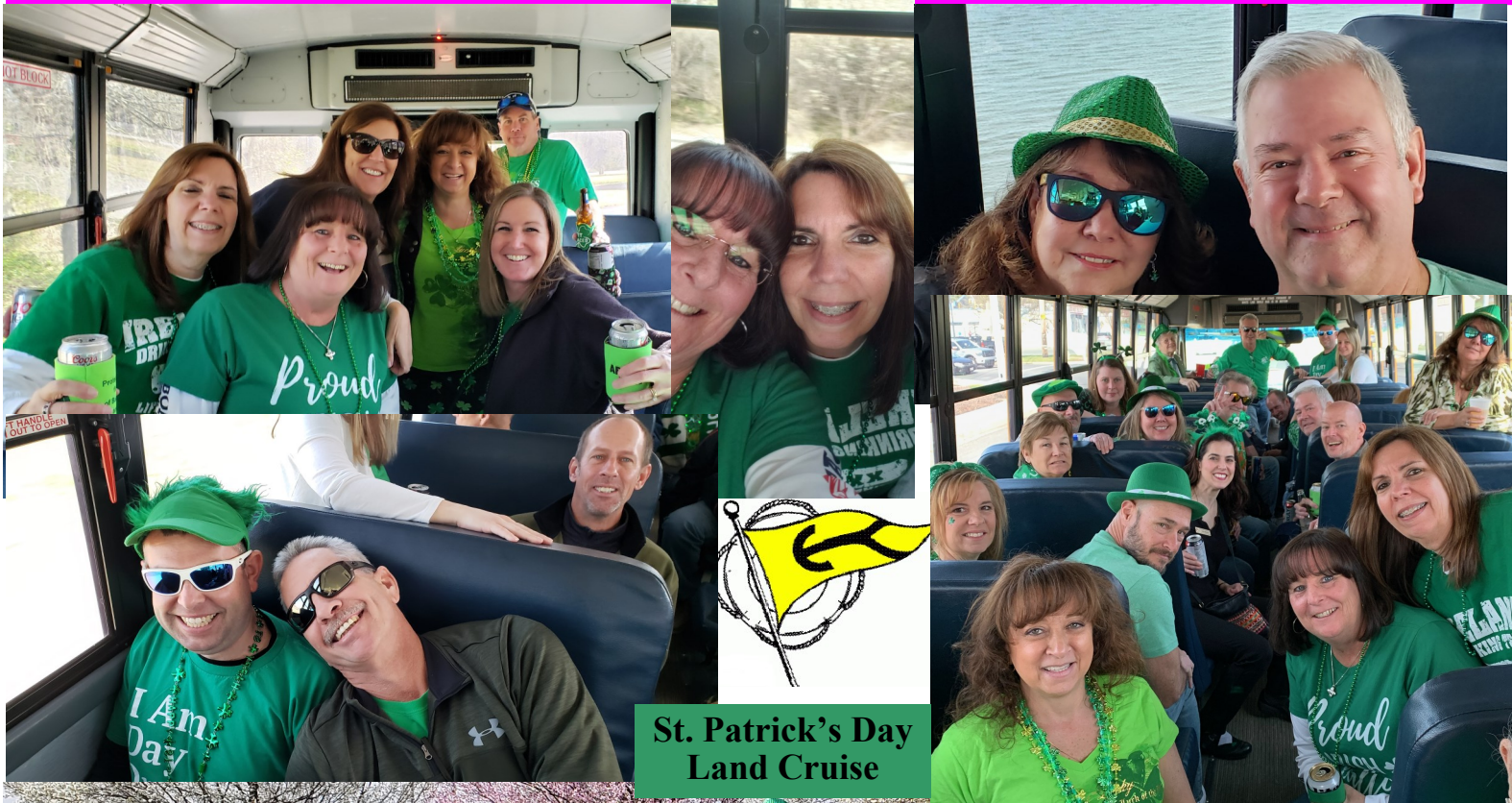
St. Patrick's Day Land Cruise