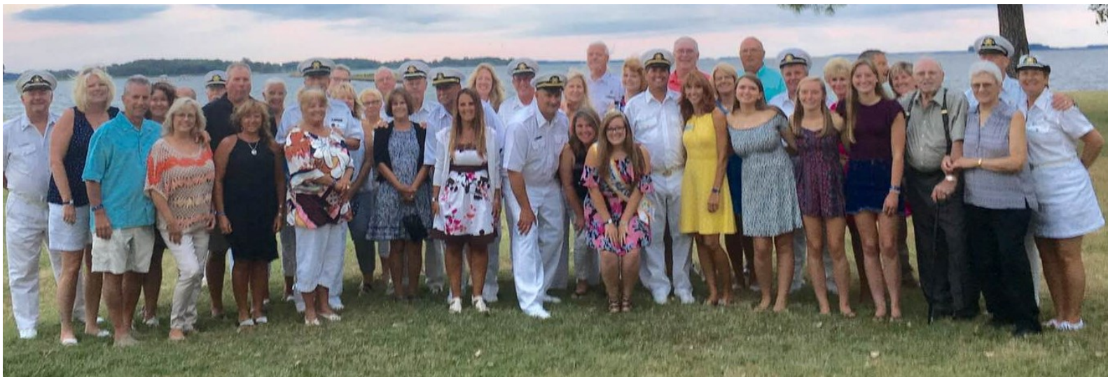
EYC Commodores dinner at Kent Island Yacht Club July 20, 2018

NOTE: Eastern Yacht Club FLEET REVIEW is on Sept. 7 th at 1 PM line up time TBA