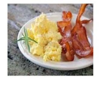
Eastern Yacht Club 2330 Seneca Rd. Essex, MD 21221