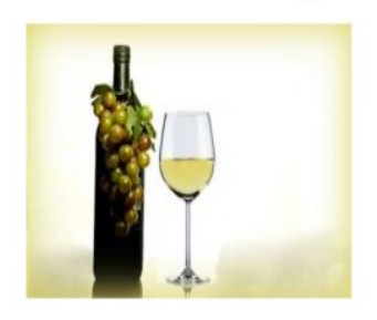
Presented by the EYC Gulls

Come and enjoy all your breakfast favorites