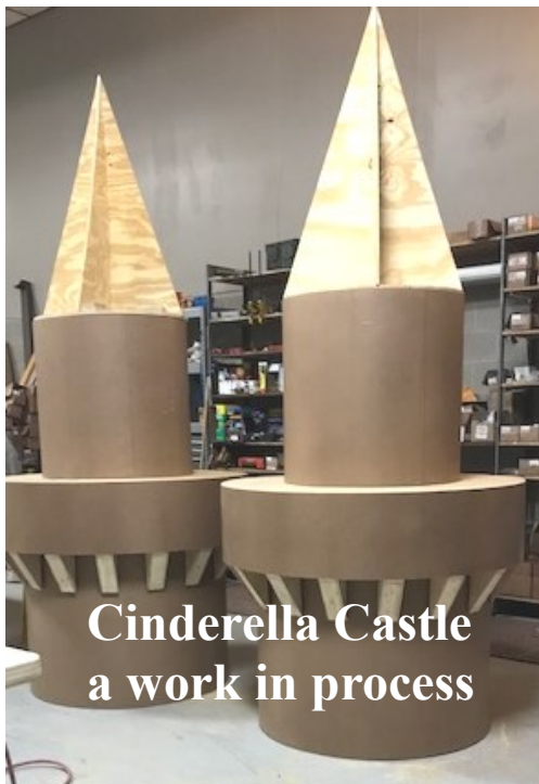
Cinderella Castle a work in process