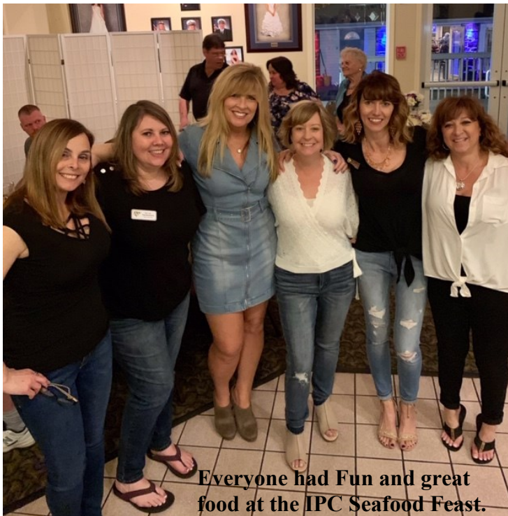
Everyone had Fun and great food at the IPC Seafood Feast.