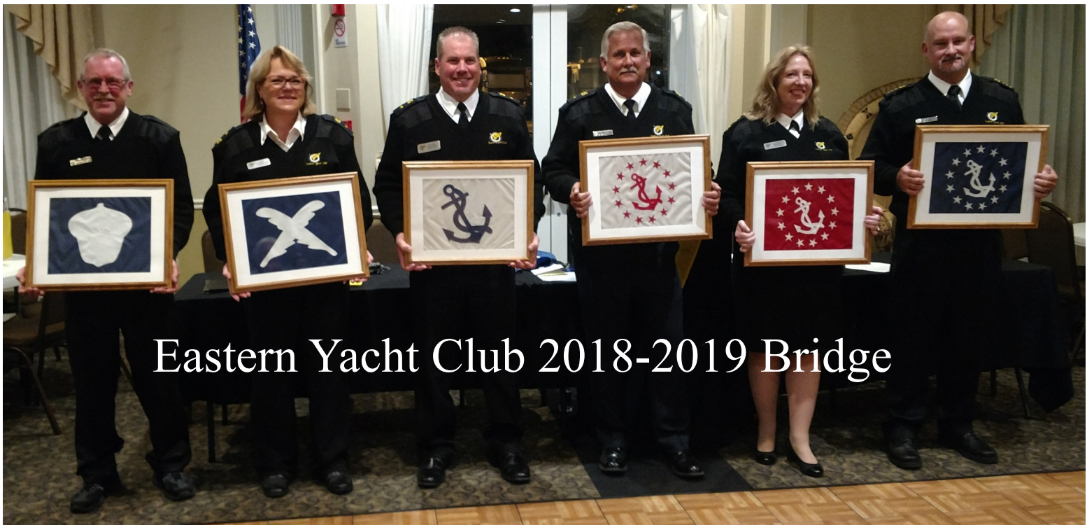
Eastern Yacht Club 2018-2019 Bridge