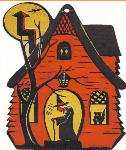
IS