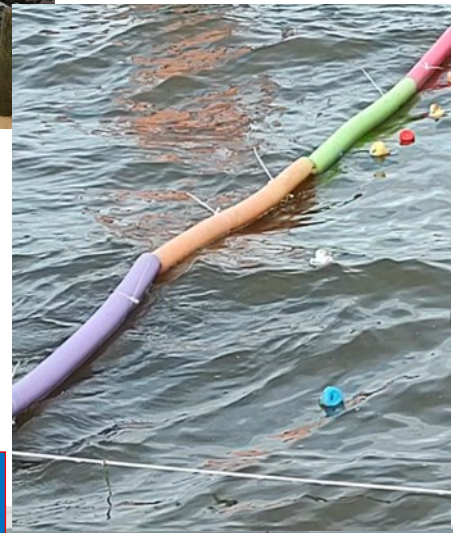
Duck Racing & Picnic