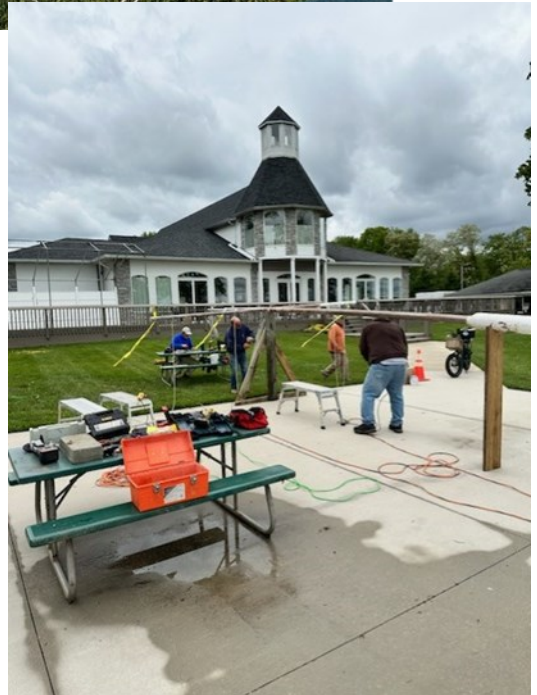
The repainting of the flag pole!!