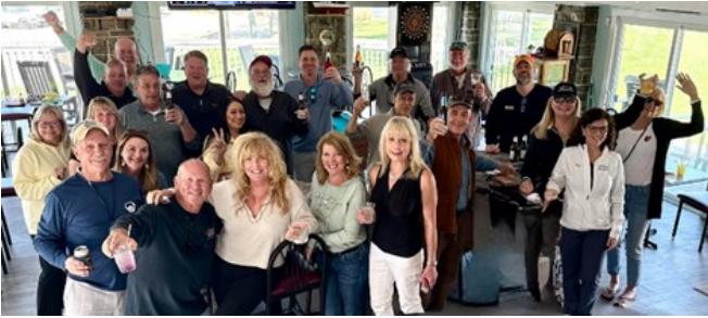
Baltimore In The House !!!!