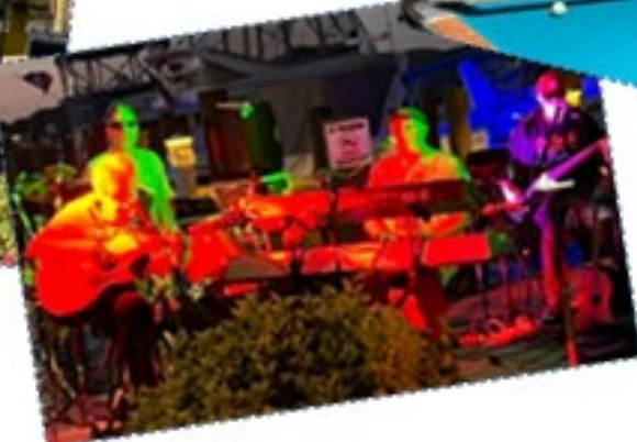
A Pier Opening